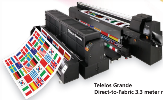
Teleios Grande Direct-to-Fabric 3.3 meter machine

Our three high-speed solvent printers have the capacity to print 1,500 sq. ft. per hour. The solvent printing process employs durable and vibrant inks that promote strong adhesion and excellent longevity. With a robust resistance to fading and scratching, solvent printing is ideal for both indoor and outdoor applications. Solvent printing is an economical alternative for banner stand graphics.