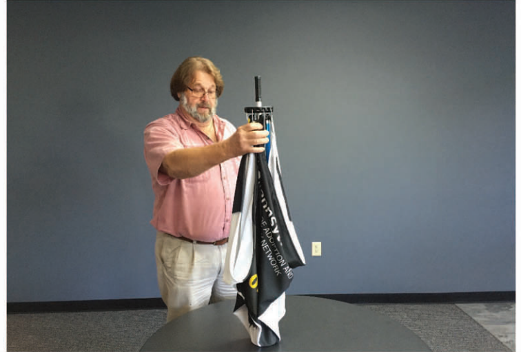
Stand ShowFlex upright on table