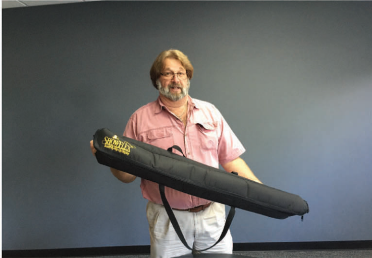
ShowFlex with padded travel bag.