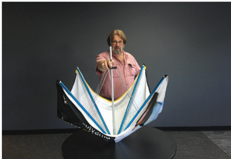
Push down on hub while unfolding the legs.