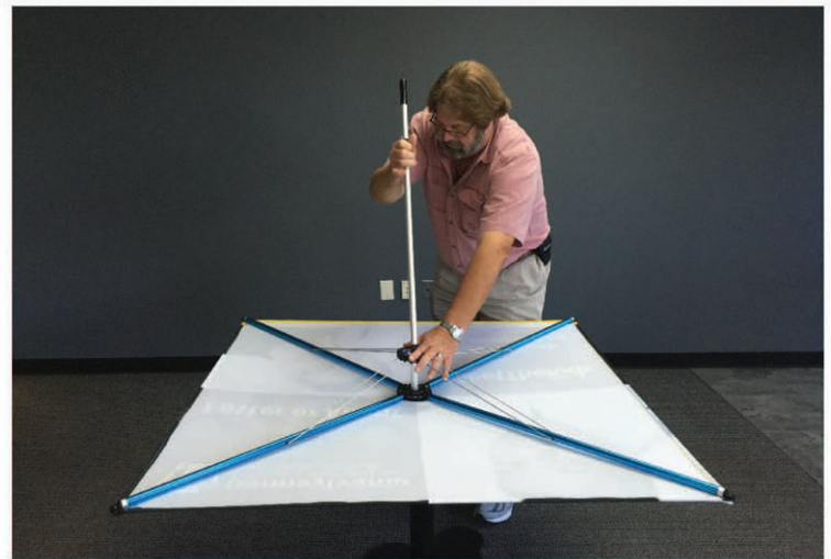
Push hub all the way to the bottom of the hinged leg.