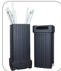
Case fits with Formulate tubes and graphics