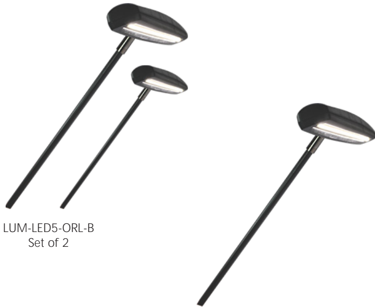
LUM-LED5-ORL-B Set of 2

Lighting can create a powerful, impactful presence or display. Illumination is an important piece of the puzzle to achieve the mood, style and staging that you desire. Incorporate modern, bright LED light into your display and draw attention to your brand and message with elegance. With a contemporary profile, you can modernize your display, set the stage, and better communicate a clear message.